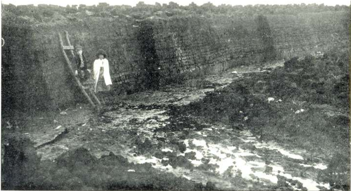
Pike Hill Moss Peat Holes, Glaisdale Head.