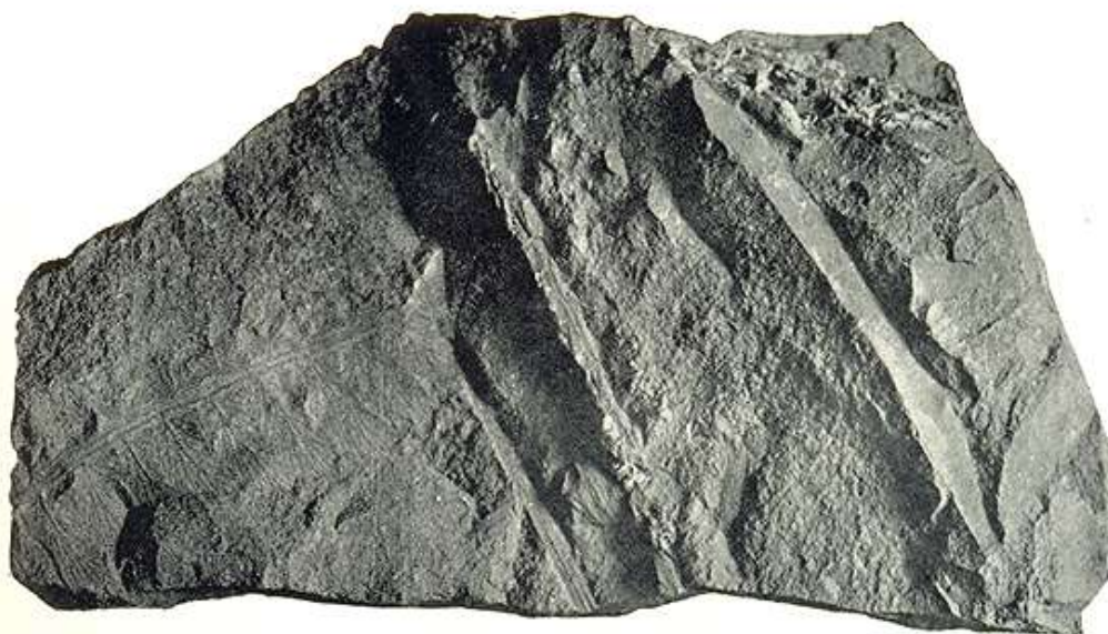
Cladophlebis haiburnensis , L. and H., Marske Quarry. Only two specimens of this species have been recorded from Yorkshire.