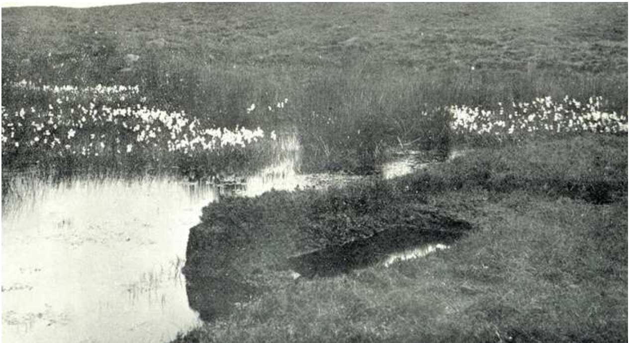
Cotton Grass ( Eriophorum angustifolium) in fruit, Danby Dale. July 1909.

Great Ayton, Danby Low Moor, Rosedale Read Moors, at the head of Stockdale where a section several yards in length was observed in a gully, on the ridge between Glaisdale and Butler Beck, above the Kellaways Rock on Gerrick Moor, on Rudland Rigg between Farndale and Bransdale. In the last locality the section was very remarkable, the pan being contorted and nearly two inches thick. Pan is not always visible in sections owing to the action of frost, and therefore conclusions as to its non-occurrence must always be doubtful.