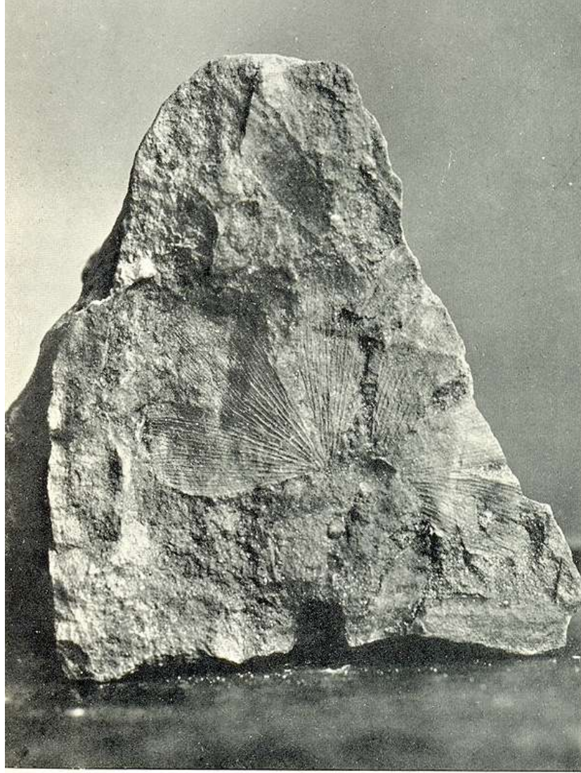
Ginkgo digitata (Brong.) from Inferior Oolite, Marske Quarry.